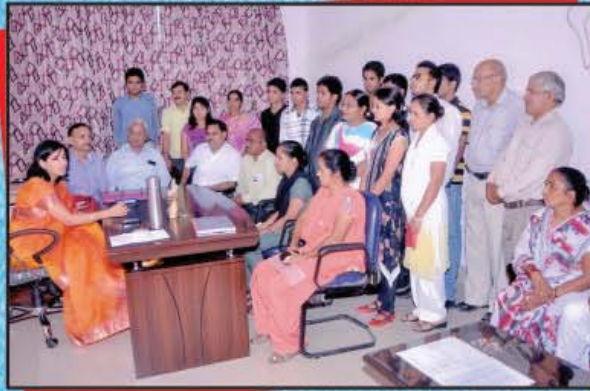
Parent-Teacher Meets are high on our agenda.