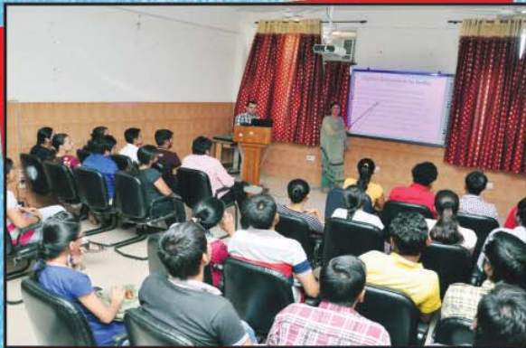
A Smart Class is on in real earnest.