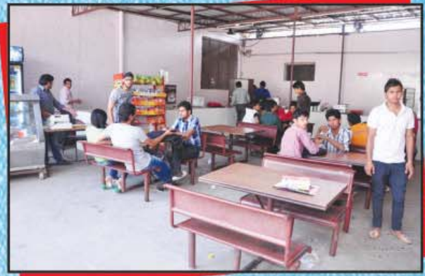
Cafeteria time is carefree time.