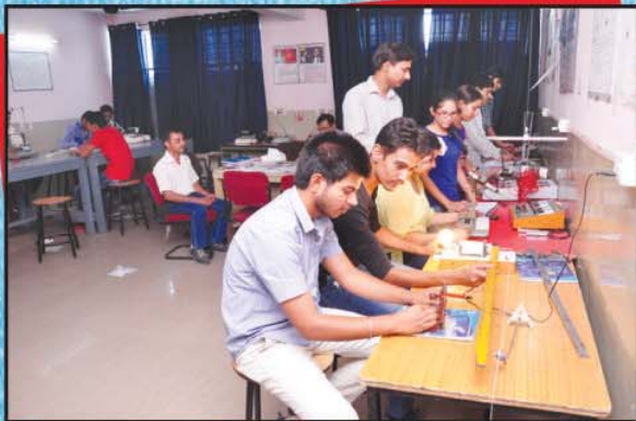
Science Labs being put to good use