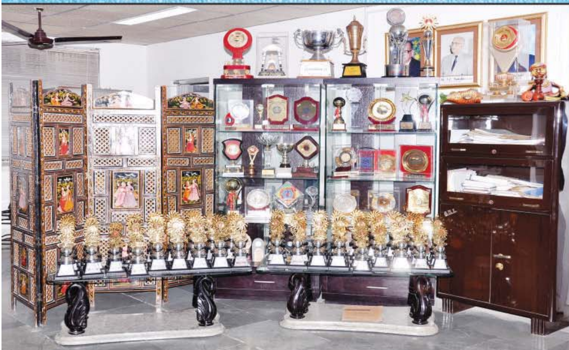
The rich collection of trophies speaks volumes for our excellent track record of all-round achievements.