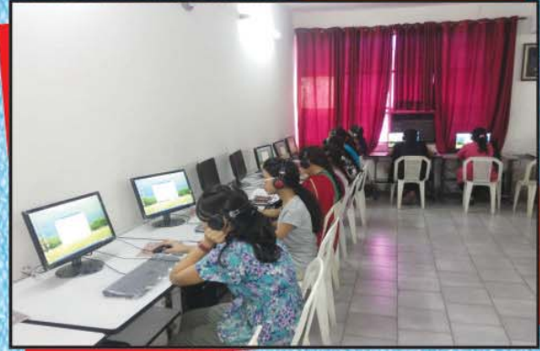
Language Lab is where our students add to and hone their linguistic skills.