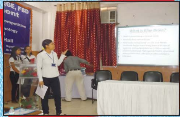
Our students use the latest technology with aplomb.