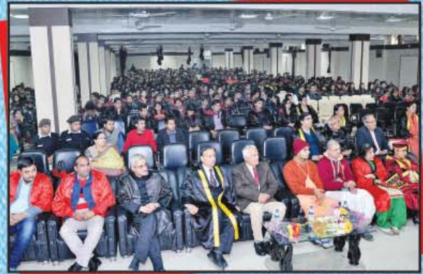
The sprawling College Auditorium is ever abuzz with activity.