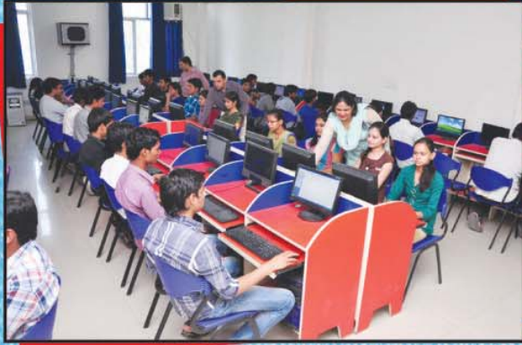
Students make optimum use of our state-of-the-art Computer Labs.