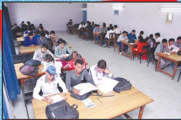
Our scholars absorbed in books in the spacious Reading Room of the Main Library.